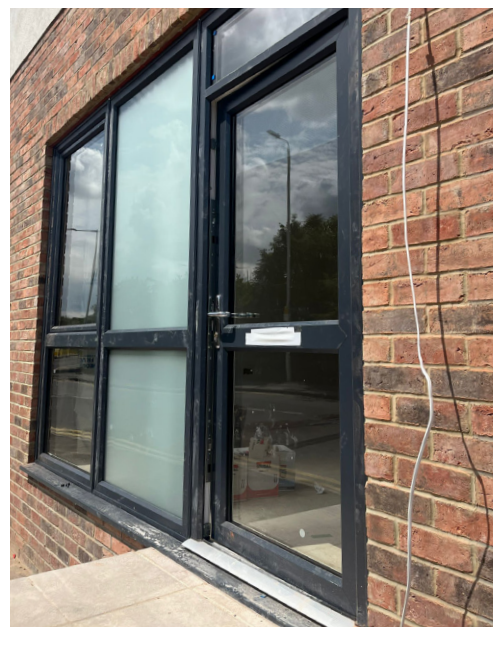
Photo showing BSI Kitemark<sup>™</sup> Certified Flood Door with Low Threshold