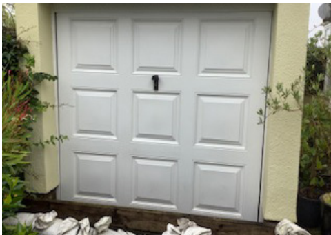
Photo shows garage door before Flood French Door Installation

Replace the existing garage doors with a Defender flood patio door and installation of an intercepting Aco drainage channel in front of the new doors with connection to the existing underground drainage system.